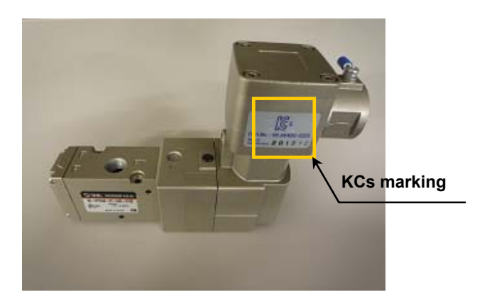
50-VPE Series (3 port): -X100

Note) Please note that this product cannot be used as an explosion proof specification valve outside of Korea.